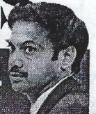
Illustration: ARNEESH Third-party Insurance, Health Cover >> 20

Prasad Calls Sunny's Jibe at Selectors 'Unfortunate' SPORTS: THE GREAT GAMES >> 22